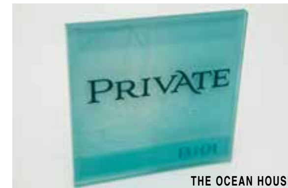
THE OCEAN HOUSE

Everything we make is custom, so you can pick from a complete range of materials, styles, colors, and sizes. Just to name a few, you have the freedom to select Acrylic, Chemetal, wood products, magnetic and other inserts, glass, and Waterjet cutting, including Romark or raised lettering using any colors you desire.